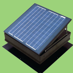
30 Watt Solar ventilation

Experience a cozier home while saving on heating and cooling costs.